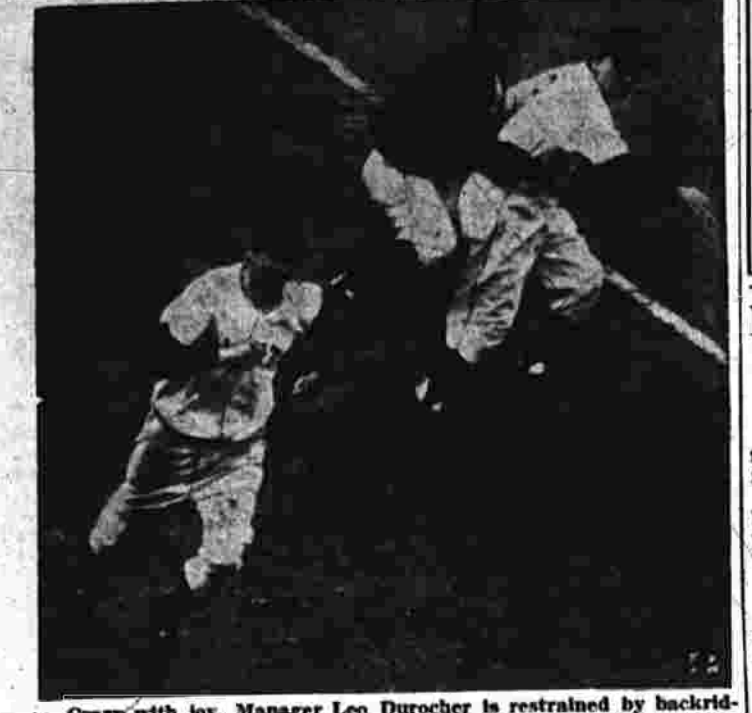
Manager Leo Durocher is restrained by backfielder Stan Musial as he looks on from the dugout during the Polo grounds game.