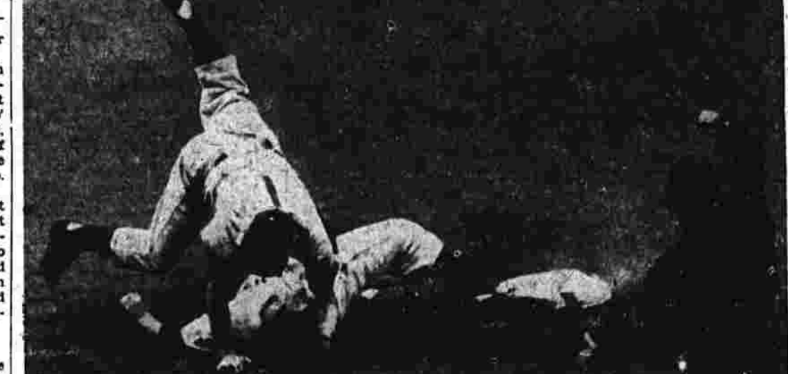
Catcher Wes Westrum of the New York Giants spills Peewee Reese of the Dodgers in this fashion at second base in third inning of final National League playoff game at Polo Grounds.